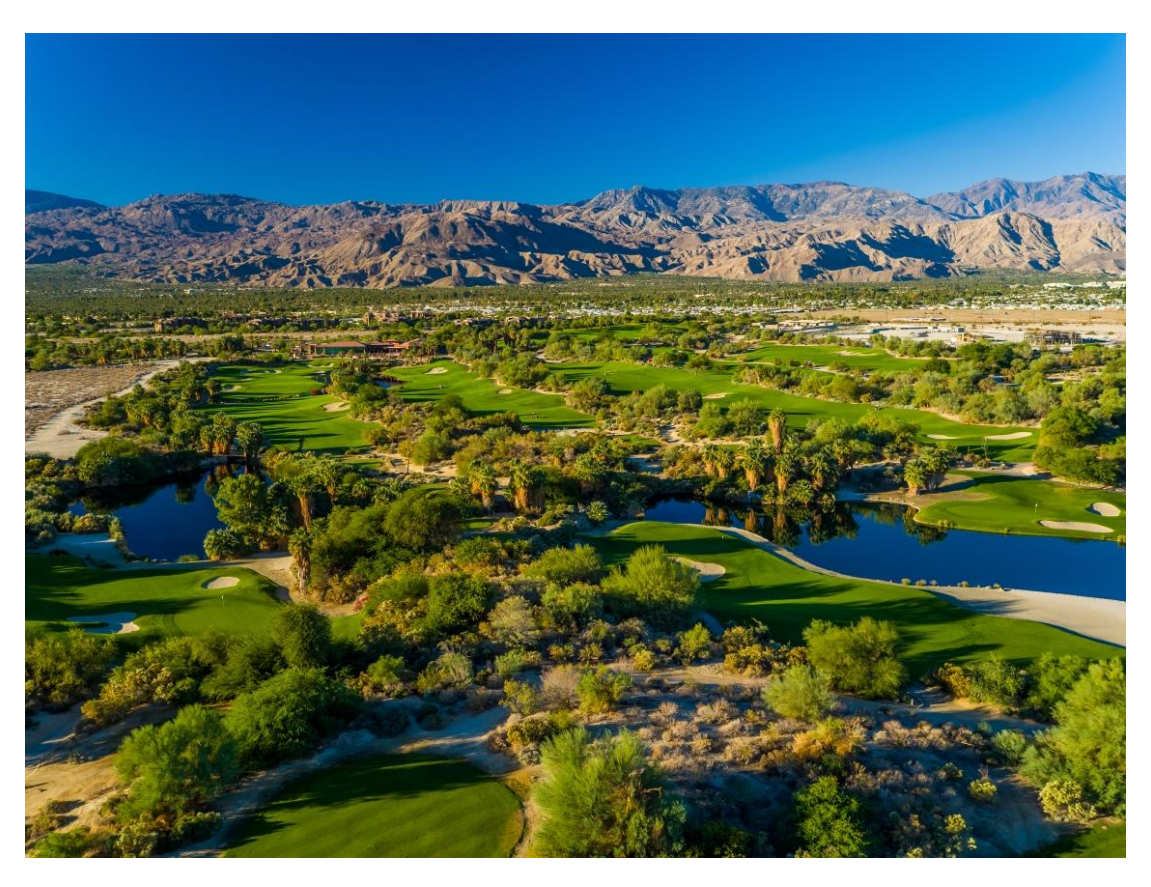
Overnight at La Quinta Resort & Club - Resort Casita Rooms

Firecliff Course is ranked by Golfweek's Best 2022, in the Top 200 Resort Golf Courses in the US. The course, measuring 7,056 yards, is a true test of skill where golfers must negotiate their way around extensive natural areas, numerous water features and more than 100 bunkers/waste areas. The views as you play this golf course, located on the desert floor in the Coachella Valley, surrounded by mountains and simply stunning.