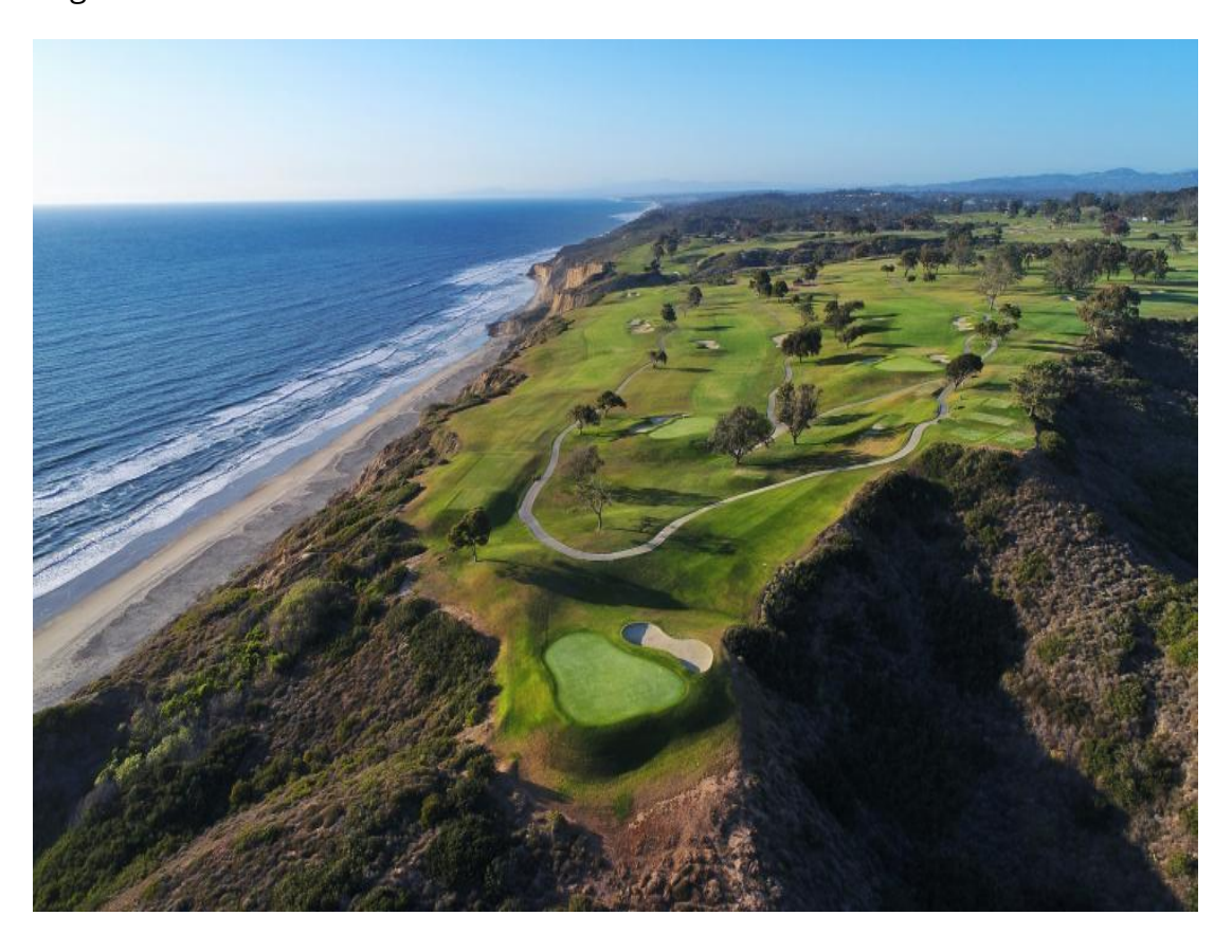
Group Transfer to Palm Springs