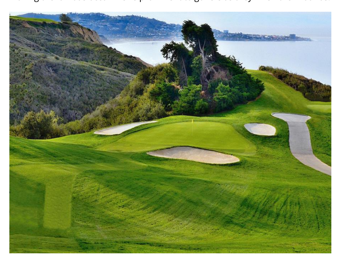
Overnight at The Lodge Torrey Pines - Signature Room

Perched above the cliffs overlooking the Pacific Ocean, Torrey Pines is one of California's most iconic golfing destinations. The course is named after the Torrey pine, a rare tree that grows in the wild in very few places including along this local stretch of the coastline in San Diego County. In 2016, the North Course underwent a $12.6 million improvement and redesign by noted golf course architect Tom Weiskopf. Featuring fewer bunkers (reduced from 60 to 42) and larger greens than before (increased from 4,500 square feet to 6,000), the North Course has also switched the front nine holes with the back nine, making the famous ocean views prominent to golfers as they finish their rounds.