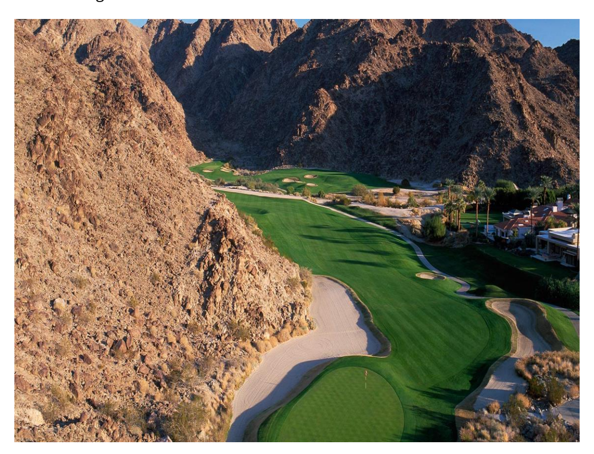
Overnight at La Quinta Resort & Club - Resort Casita Rooms

The Mountain Course, nestled at the base of the picturesque Santa Rosa Mountains, is famed for its Pete Dye design, playability and stunning visuals. This ultra-challenging course features pot bunkers, rock formations, elevations of tee boxes and well-bunkered greens. It is famous for its unique design and visually stunning setting. This La Quinta golfer's paradise demands accurate, strategic play while providing the ultimate in breathtaking views.