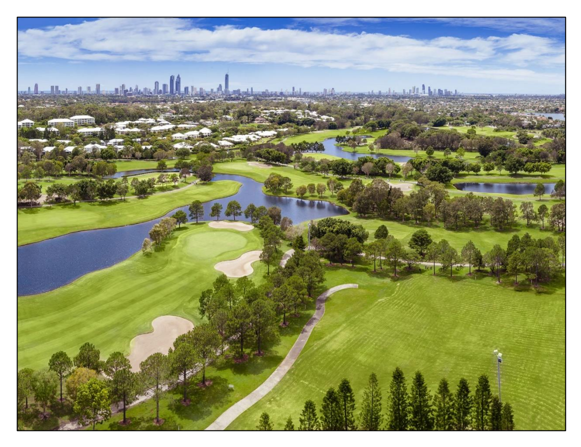
Overnight at Meriton Suites Broadbeach - One Bedroom Modern Suite

The RACV Royal Pines Resort, located around the banks of the Nerang River, hosts some of the nation's most prestigious tournaments, including the Australian PGA Championship and the RACV Australian Ladies Masters. What was once a flat course with wide fairways, has been turned into an undulating links-style layout with challenging rough and difficult greens on multiple levels.