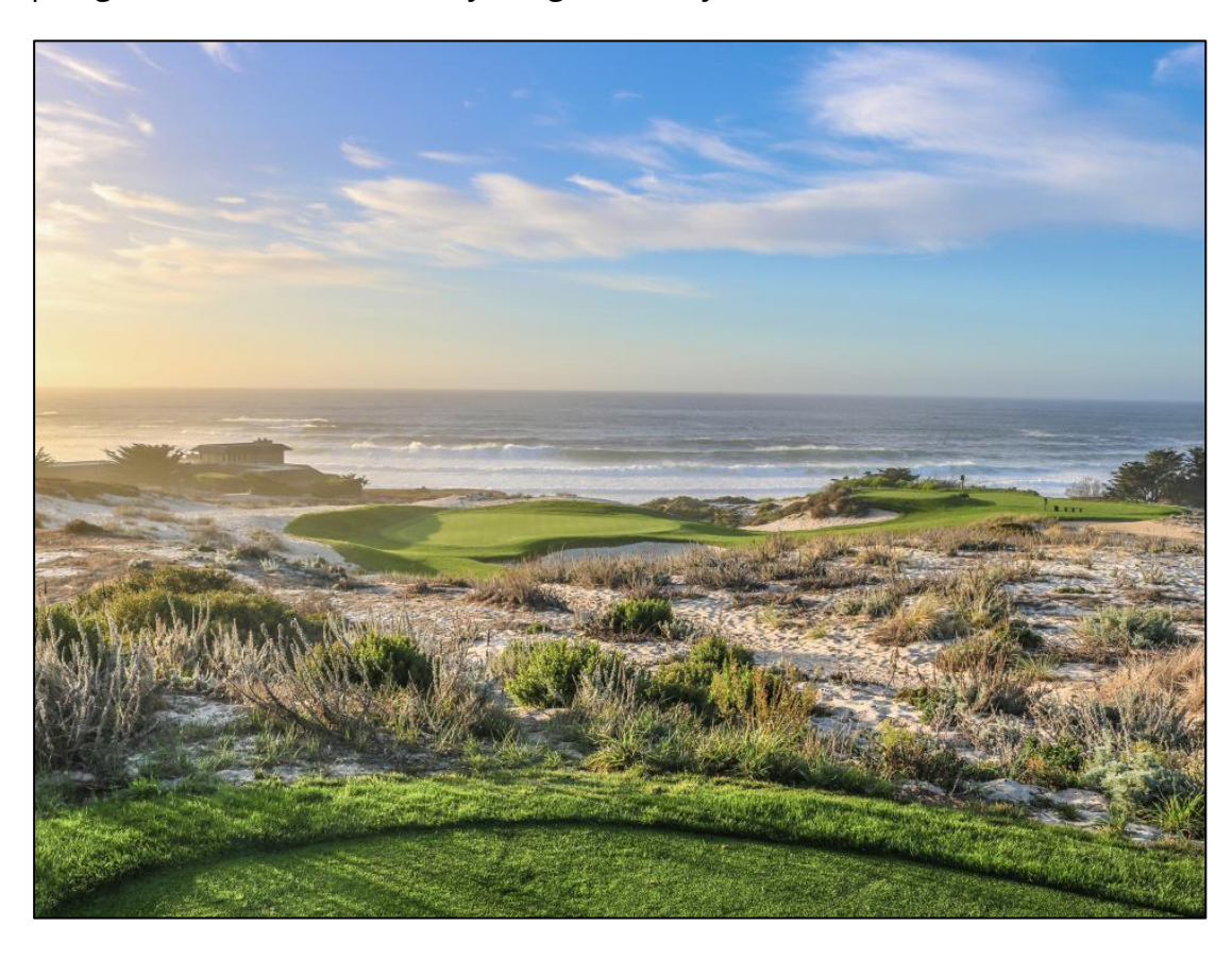
Optional Dinner with Host (at own cost)

If Pebble Beach is the Greatest Meeting of Land and Sea, then perhaps Spyglass Hill should be dubbed the Greatest Meeting of Sand and Trees. The defining takeaway at Spyglass Hill is how starkly the first five holes juxtapose the rest of your round. Sweeping ocean views with holes darting through a daring dunescape give way to the understated natural beauty and brawn of the Del Monte Forest. Pine Valley-by-the-Sea meets Augusta National, as Sports Illustrated eloquently described it. As an annual co-host of the AT&T Pebble Beach Pro-Am, as well as a stroke-play venue for a pair of U.S. Amateur Championships (1999 and 2018), Spyglass Hill's championship pedigree has been validated by the game's very best.