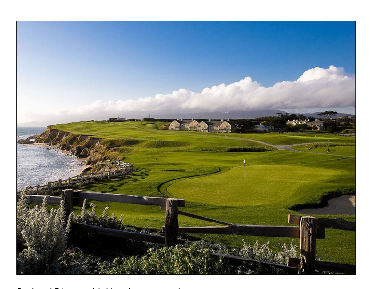
Optional Dinner with Host (at own cost)

Favourites include the opening par-five, the Ritz-Carlton backed number 9 and the final four holes ending at the turn between hole 17 and 18 known as "Palmer Corner." The finishing hole is the postcard photo and one of golf's highest ranked holes in the country—a 405-yard par-four stunner framed by the blue Pacific.