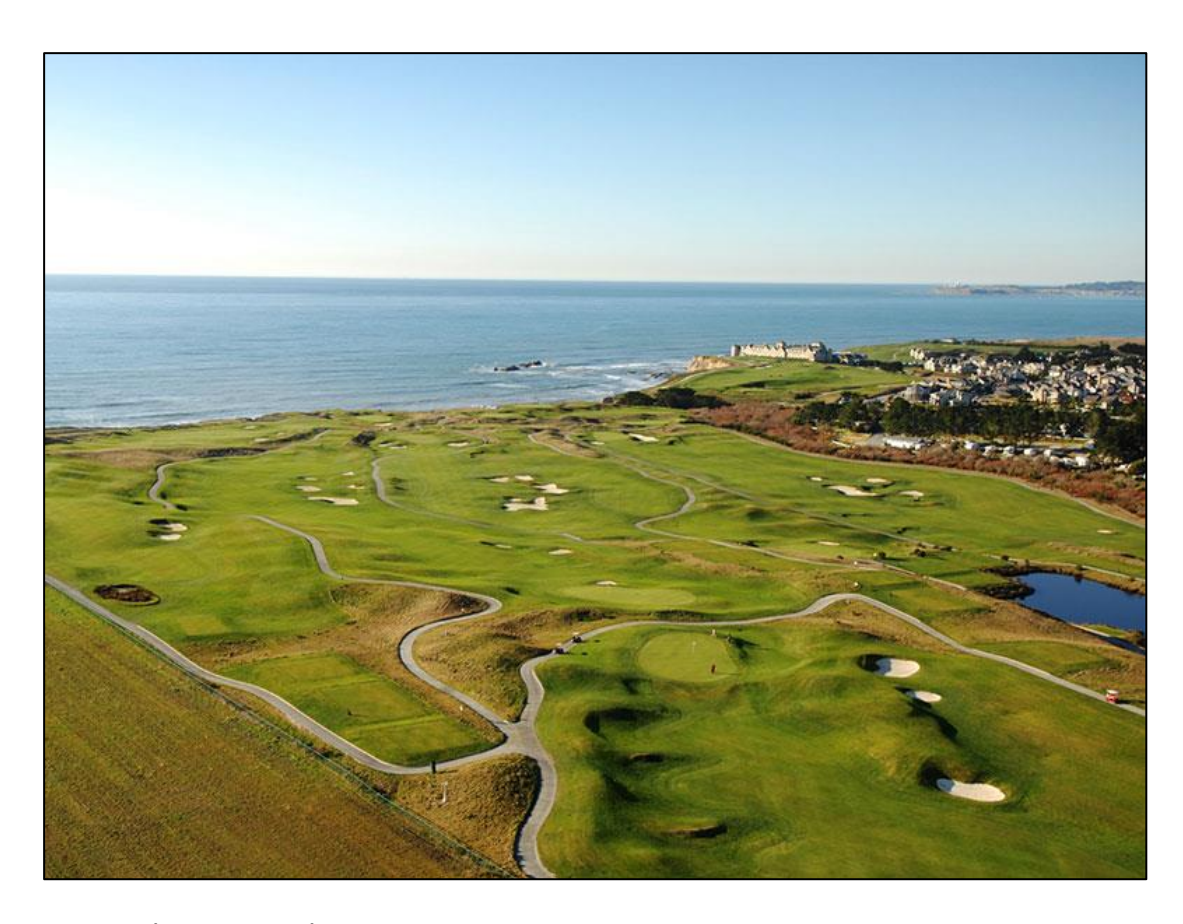
Optional Dinner with Host (at own cost)

While views of the Pacific can be found on nearly every hole, it is the final three holes that truly set the course apart. From an elevated perch, the 16th hole kicks off the oceanside homestretch with magnificent views in all directions. This challenging par-four leads to the blufftop 17th, which some compare to Pebble Beach's famous 7th. Take a moment to enjoy the surroundings before hitting to an elegantly placed green just steps from one of the Bay Area's most beautiful beaches. Finally, after teeing off over Cañada Verde Creek canyon, you'll finish on the oceanside 18th hole to the base of the incomparable Ritz-Carlton, Half Moon Bay. Time it right and you'll hear the sound of traditional Scottish bagpipes lead you to the clubhouse as the sun sets.