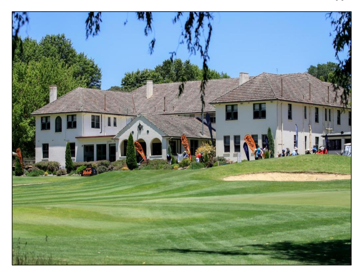
Overnight at Dormie House - Refurbished Single or Twin Rooms