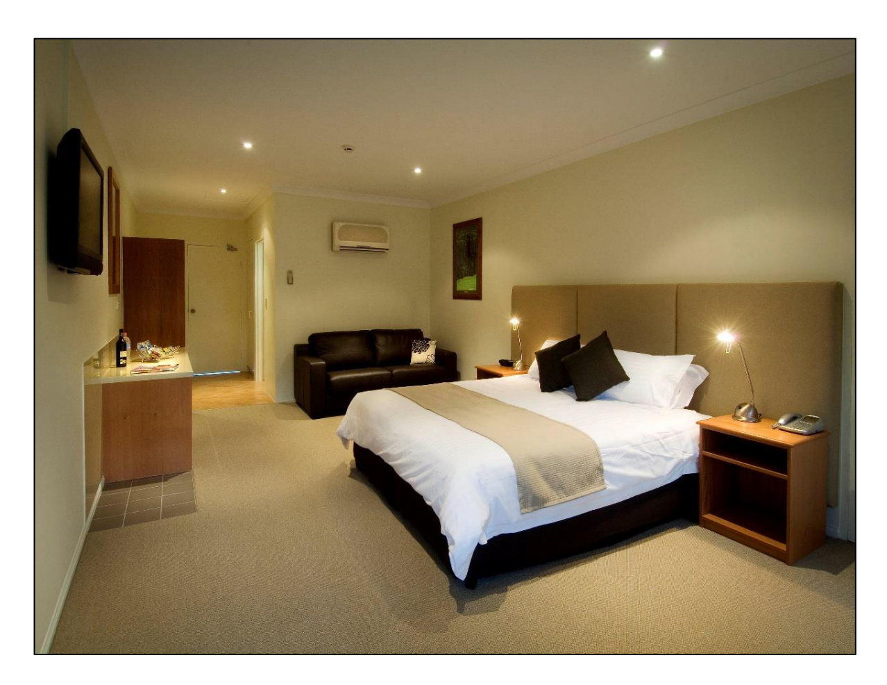
3 Course A la Carte Dinner (included)

The friendly and relaxed atmosphere of Bonville Golf Resort makes it a perfect for our guests who enjoy group activities and the company of friends. Here you will enjoy the peace and serenity that Bonville is famed for, first hand. After the days golf, swim in the billabong style swimming pool, or take a relaxing rainforest walk before retiring to your onsite accommodation. The breathtaking beaches of Sawtell are also just 5 minutes away.