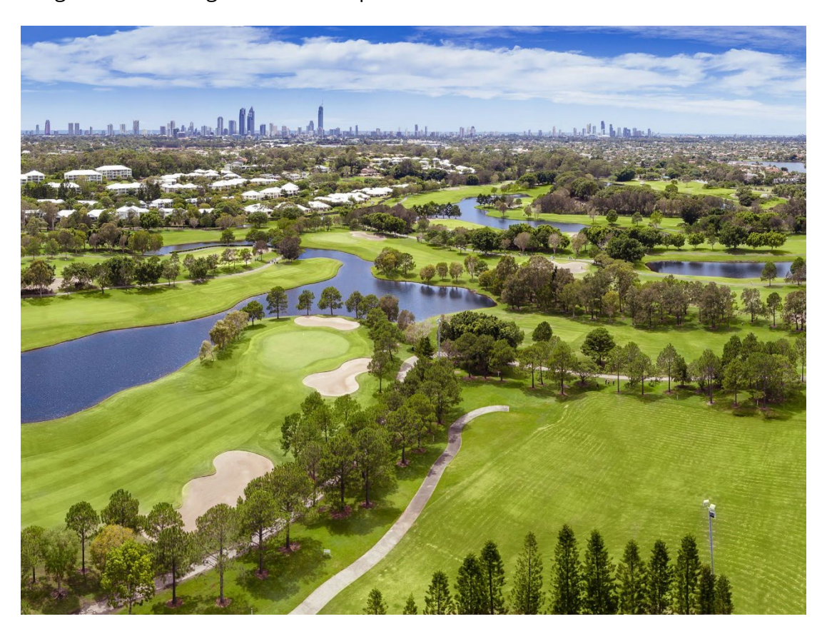
Overnight at Meriton Suites Broadbeach - One Bedroom Modern Suite

The RACV Royal Pines Resort, located around the banks of the Nerang River, hosts some of the nation's most prestigious tournaments, including the Australian PGA Championship and the RACV Australian Ladies Masters. What was once a flat course with wide fairways, has been turned into an undulating links-style layout with challenging rough and difficult greens on multiple levels.