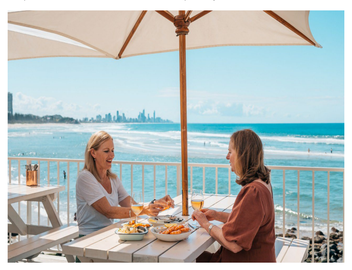
Overnight at Meriton Suites Broadbeach - One Bedroom Modern Suite

Today, spend the day as you like! Choose to relax, shop or pamper yourself, making the most of the vibrant Gold Coast, and our prime location in the heart of Broadbeach. Shops, beaches and restaurants are all steps away from the Meriton Suites.