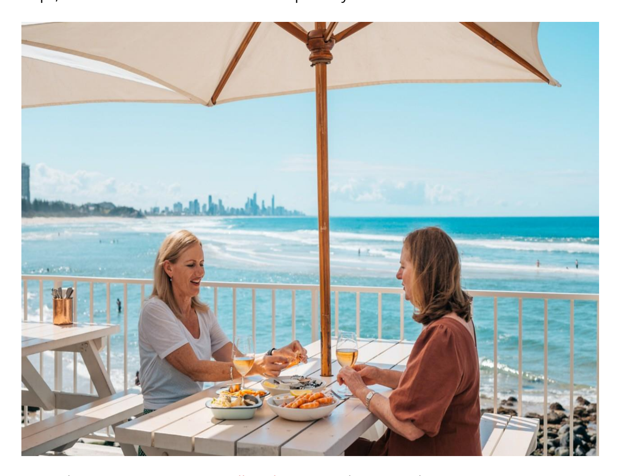
Overnight at Meriton Suites Broadbeach - One Bedroom Modern Suite - 4-Star

Today, spend the day as you like! Choose to relax, shop or pamper yourself, making the most of the vibrant Gold Coast, and our prime location in the heart of Broadbeach. Shops, beaches and restaurants are all steps away from the Meriton Suites.