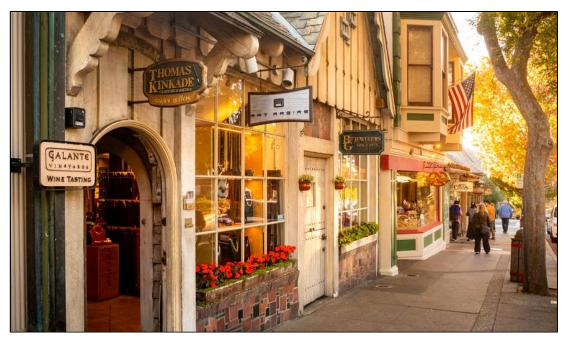
Overnight at The Inn at Spanish Bay Pebble Beach - 5 Star - Garden View Room