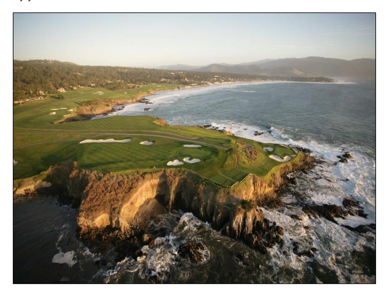
Overnight at The Inn at Spanish Bay Pebble Beach - 5 Star - Garden View Room

Enjoy the round of a lifetime at Pebble Beach.