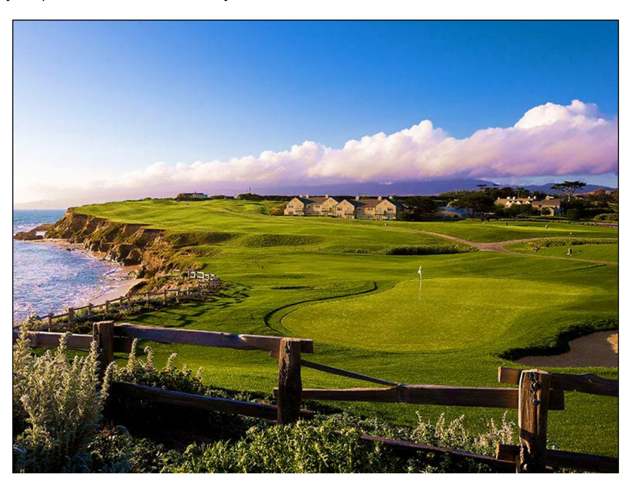
Overnight at Ritz Carlton Half Moon Bay Resort - 5 Star - Guest Room

Opening in 1973, The Old Course is an American classic designed by Arnold Palmer and Francis Duane. A lush parkland design, it features distinguishing edges and corridor views of the Pacific. The course includes several challenging doglegs, multiple water hazards and tree-lined fairways which rewards the strategic player over long-hitters. With 5 tees to choose from however, you can choose how difficult the course plays. Favorites include the opening par-five, the Ritz-Carlton backed number 9 and the final four holes ending at the turn between holes 17 and 18 known as "Palmer Corner." The finishing hole is the postcard photo and one of golf's highest ranked holes in the country—a 405-yard par-four stunner framed by the blue Pacific.