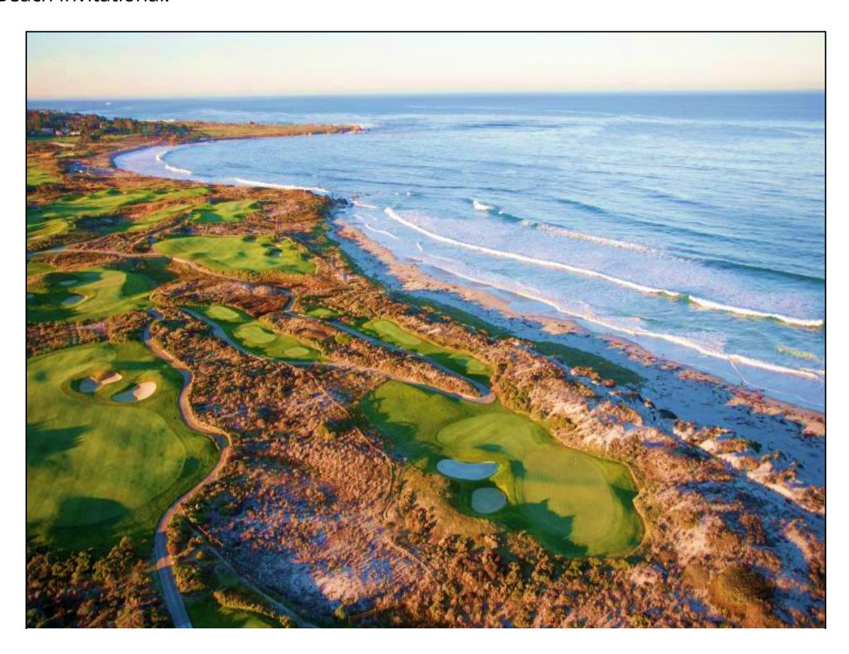
Overnight at The Inn at Spanish Bay Pebble Beach - 5 Star - Garden View Room

A twilight round is punctuated by the tunes of the famed Spanish Bay bagpiper, who puts the course to bed every evening. Spanish Bay is ranked among the best public courses in the state and the country, and annually hosts the pros during the TaylorMade Pebble Beach Invitational.