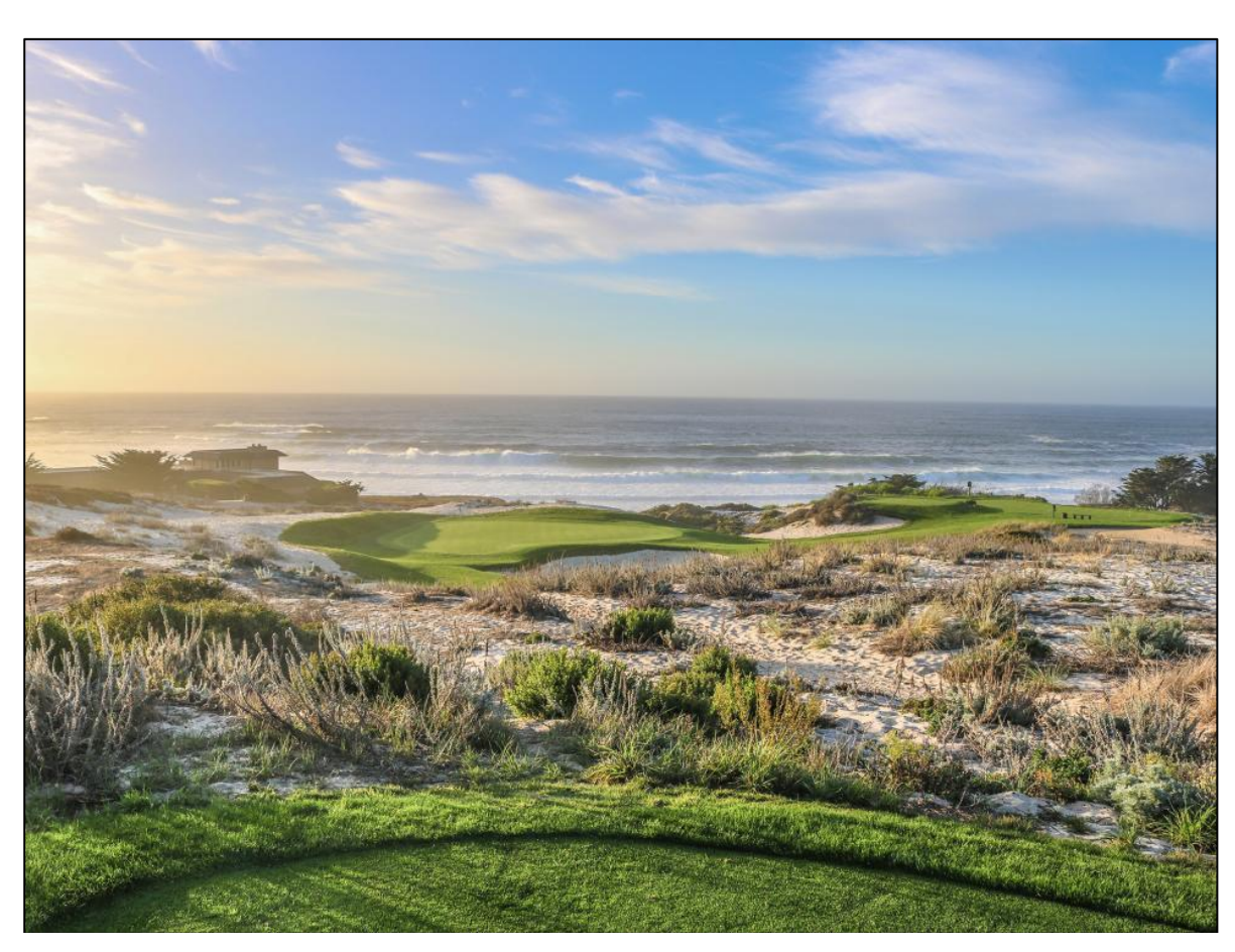
Overnight at The Inn at Spanish Bay Pebble Beach - 5 Star - Garden View Room

As an annual co-host of the AT&T Pebble Beach Pro-Am, as well as a stroke-play venue for a pair of U.S. Amateur Championships (1999 and 2018), Spyglass Hill's championship pedigree has been validated by the game's very best.