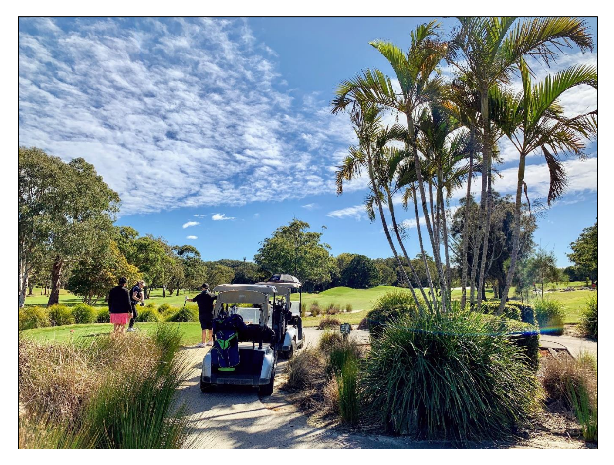
Overnight at Elements of Byron - Botanica Villa or Superior 2 Bedroom Villa - 5 Star

The Byron Bay Golf Club is an 18-hole championship course, set out on 120 acres of lush coastal habitat. Gently undulating with some tees offering panoramic views to the famous Cape Byron lighthouse and the Pacific Ocean. The difficulty of this course depends largely on wind strength and direction. It's a par 72 course, with immaculately maintained landscaping, and holes running in all directions.