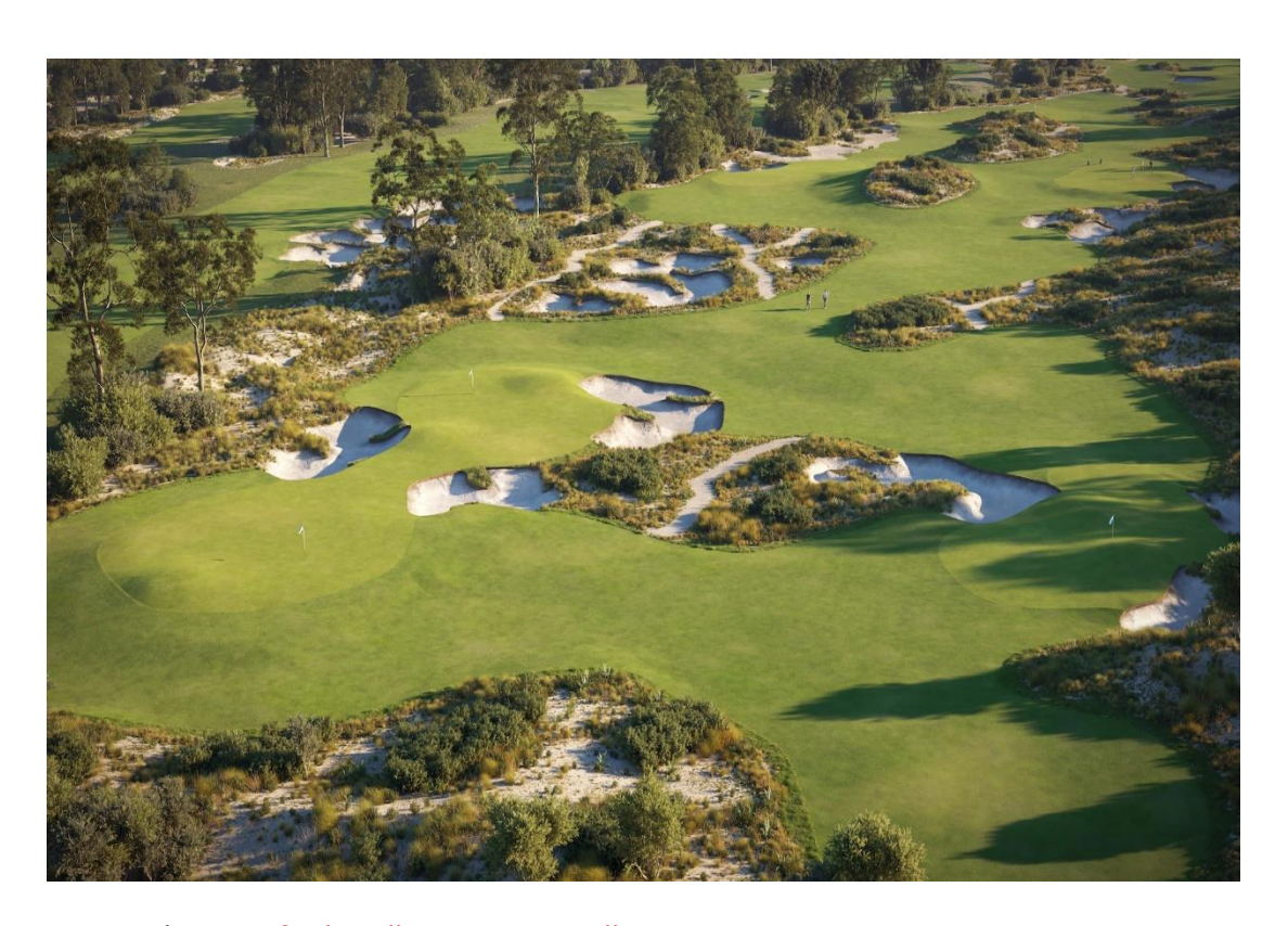
Overnight at Sofitel Melbourne On Collins - Superior Room

As an included add-on to the day, the group will be playing a warm-up round, prior to our main round, on the newly developed par 3 Course at Kingston Heath "The Furrows".