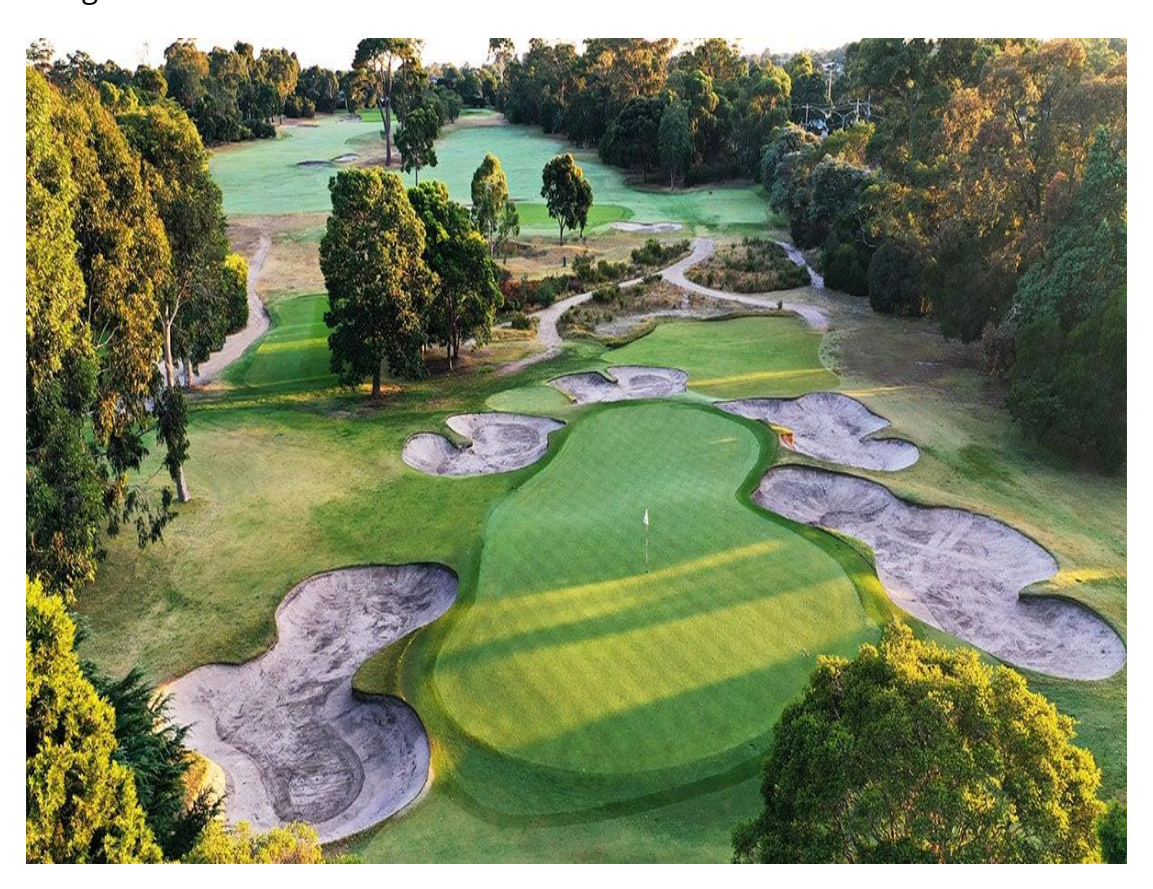
Overnight at Sofitel Melbourne On Collins - Superior Room

This is a course that has stood the test of time and pays tribute to its original layout and design.