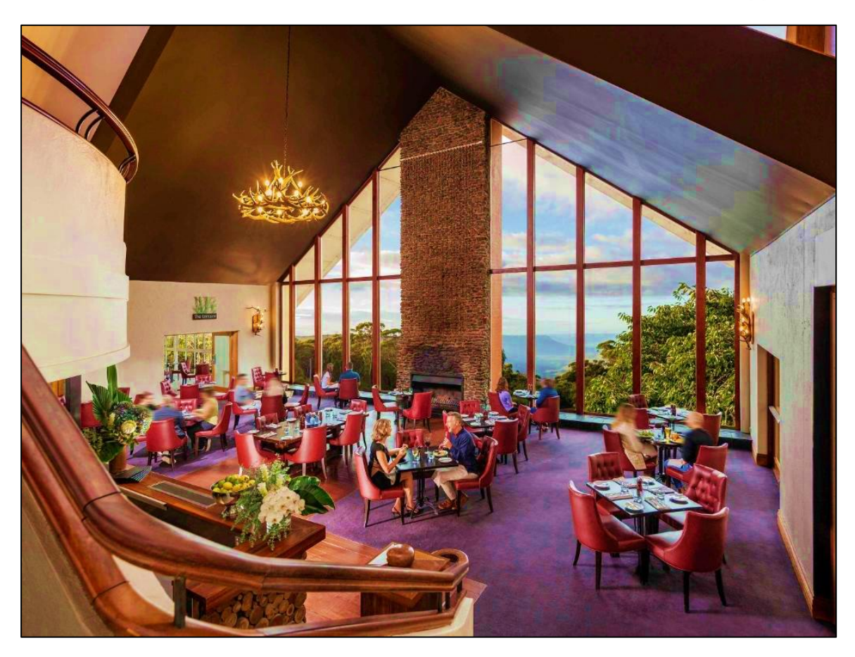
Overnight at Fairmont Resort & Spa Blue Mountains - Standard Room 4-Star

On the cusp of the dramatic Jamison Valley in the World Heritage-listed Blue Mountains National Park, the Fairmont Resort & Spa Blue Mountains is the pinnacle of upscale accommodation in Leura, one of the most charming upper-mountains villages in Australia. The boutique style rooms offer views of the manicured gardens and grounds.