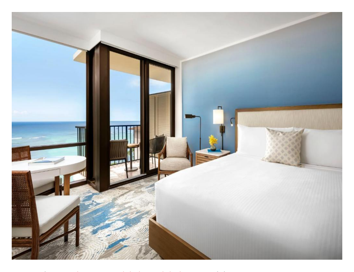
Overnight at Halepuna Waikiki by Halekulani - Waikiki Mountain View Room

After a multi-million dollar renovation, the Halepuna Waikiki by Halekulani reopened in October 2019. With its exceptional location, it is the perfect place to base ourselves for the Waikiki leg of our trip. Hotel highlights include a restaurant with an open-air kitchen and signature chocolates, as well as an eighth-floor deck with a lap pool, a Jacuzzi, cabanas, a bar, a fitness centre and a hospitality lounge. From just across the street, you step onto the famous Waikiki Beach, stroll toward iconic Diamond Head or simply relax by the water.